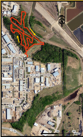
North Loop – 2.1 km