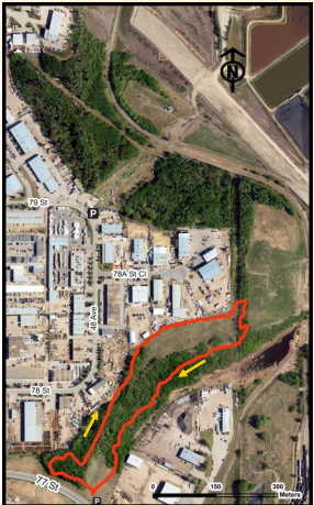
South Loop – 1.6 km