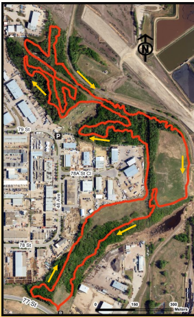
CABC Loop – 5.4 km