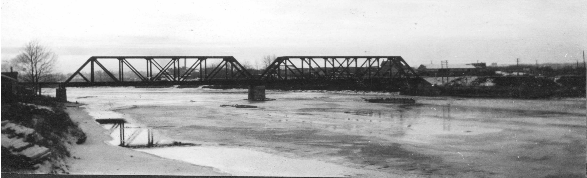
Figure 3: Historic Photo, The Canadian Pacific Railway Bridge