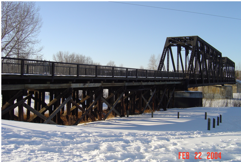
Figure 2: Contemporary Photo, The Canadian Pacific Railway Bridge