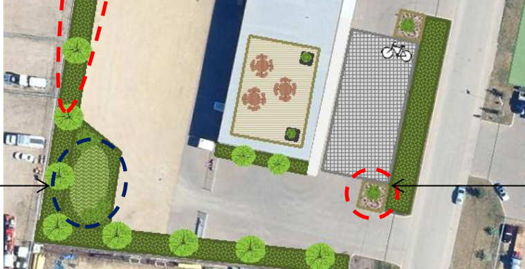
Figure 2: Example of Eco Industrial Regulations