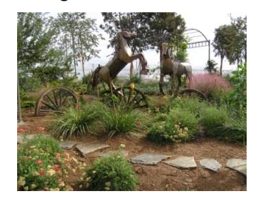
Figure 3: Example of Eco Industrial Development